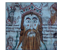
Woden God of War and Wisdom

Alfred, one of the only kings in British history to be called 'Great'. He fought the Vikings and then made peace so that English and Vikings settled down to live together. He encouraged people to learn and he tried to govern fairly.