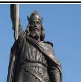
Alfred the Great

The Anglo-Saxons did not have a permanent army. However, if fights broke out, rulers could call on a group of men called the fyrd to fight. As the years went on in Anglo-Saxon England, the role of the Anglo-Saxon continued to evolve. A brand-new group of warriors emerged, known as the huscarls. These warriors originated from Scandinavia, where they would serve as bodyguards and household troops of Norse warlords and kings.